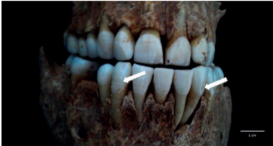
Figure 1. Linear enamel hypoplasia on the dentition of a middle aged female (Sk. 483) from Shantarín necropolis. At the right side of the jaw, the arrow shows a score 3 lesion, three visible linear grooves. The left arrow indicates a score 2 lesion.

Most individuals (9/14=64.29%) presented one hypoplastic line (score 2) while five (5/14=35.71%) showed two or more lines per tooth and thus were scored 3 (Figure 1). The number of insults (scores) ( p value=0.8586) was independent from the age at death.