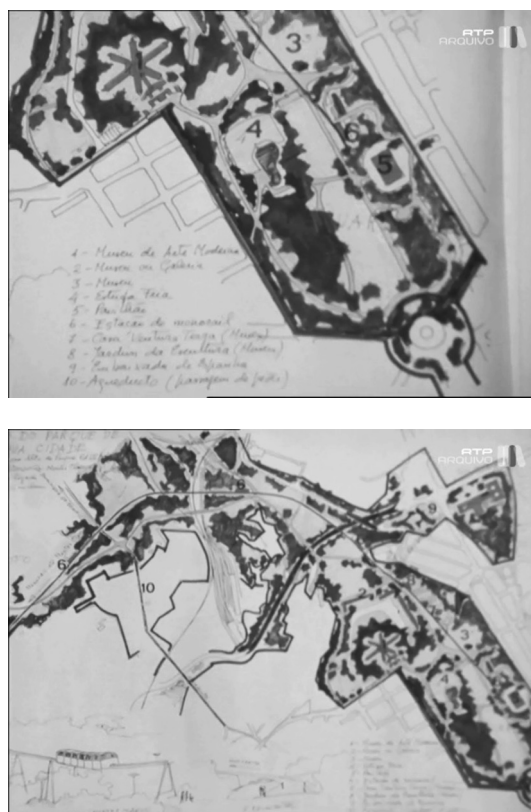
Figure 3: Frames from the interview.