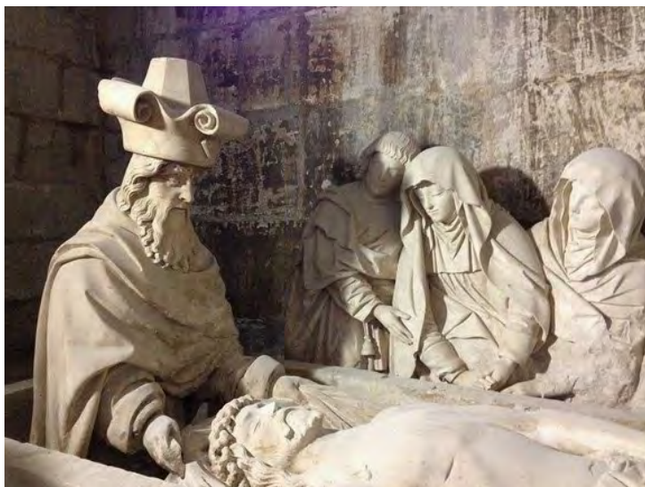
Fig. 15 - The Entombment of Christ, Cathedral of Louviers (Eure, Normandie), 1500-1506.