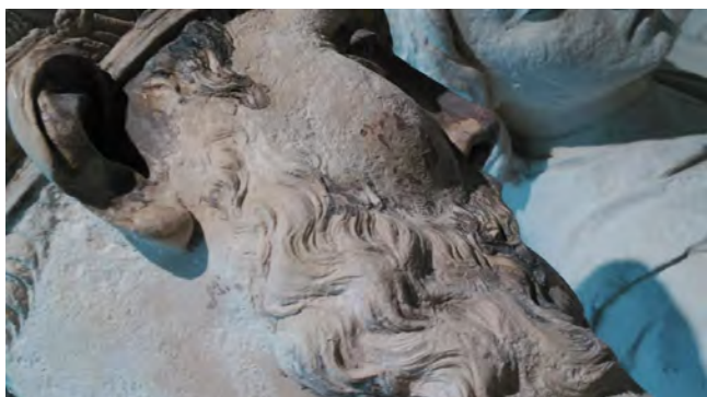
Fig. 9a - João de Ruão, The Entombment of Christ (details), Museu Nacional de Machado de Castro, nº E 109, c. 1540-1545.

Included in this set is an embossed panel with two theatrical angels holding the empty shroud at the top bottom.