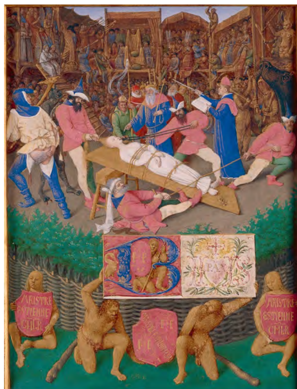
Fig. 2 - Jean Fouquet, «Martyre de Sainte Apolline», Livre d'Heures d'Etienne Chevalier, c. 1452-1456, Ms. 71. Musée Condé. Chantilly. Note: This illumination shows groups of people watching the scene. It can be the representation of a theater.