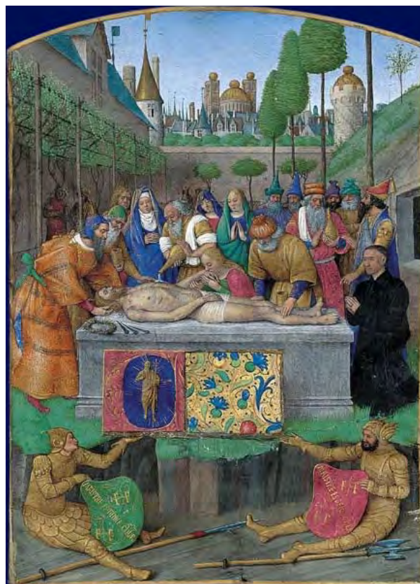
Fig. 1 - Jean Fouquet, «La Mise au Tombeau», Livre d'Heures d'Etienne Chevalier, c. 1452-1456, Ms. 71, fl. 88. Musée Condé. Chantilly. Note: In this illumination, we can see groups of citizens that can be the representation of a liturgical theater.

The late medieval sculptural representation of the Depositio Christi , which stimulated devotion