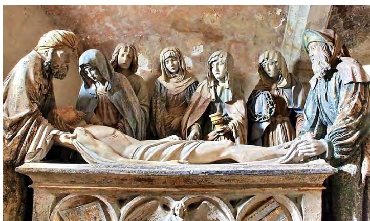
Fig. 17 - The Entombment of Christ, crypt of Saint-Jean-Baptiste Church, Chaource (Aube), attributed to Maître de Chaource, c. 1500- 1515.