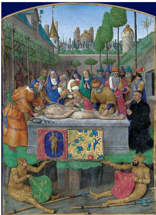
Fig. 6a - Jean Fouquet, «La Mise au Tombeau», Livre d'Heures d'Etienne Chevalier, c. 1452-1456, Ms. 71, fl. 88. Musée Condé, Chantilly.