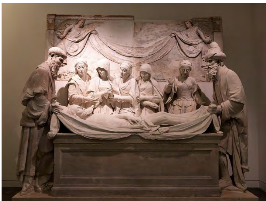
Fig. 8 - João de Ruão, The Entombment of Christ, Museu Nacional de Machado de Castro, nº E 109, c. 1540-1545.

The sculpture room of the Machado de Castro National Museum in Coimbra exhibits the sculptural group of the Depositio (nº E 109), made of limestone, with residual polychromies in some less exposed areas (Fig. 8). The group measures 222 cm by 225,5 cm.