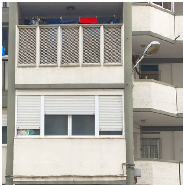
Fig.8 Category III façade with original and altered windows