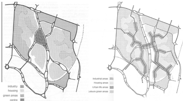
Fig.2 Basis and Definitive versions of PUC (GTH, 1965)