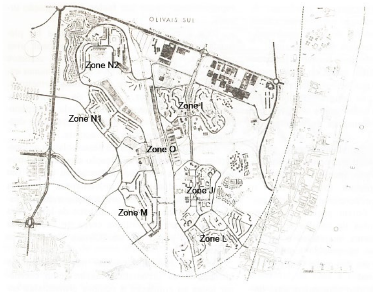
Fig.3 Definitive Plan with most Zones (adapted from Heitor, 2001)