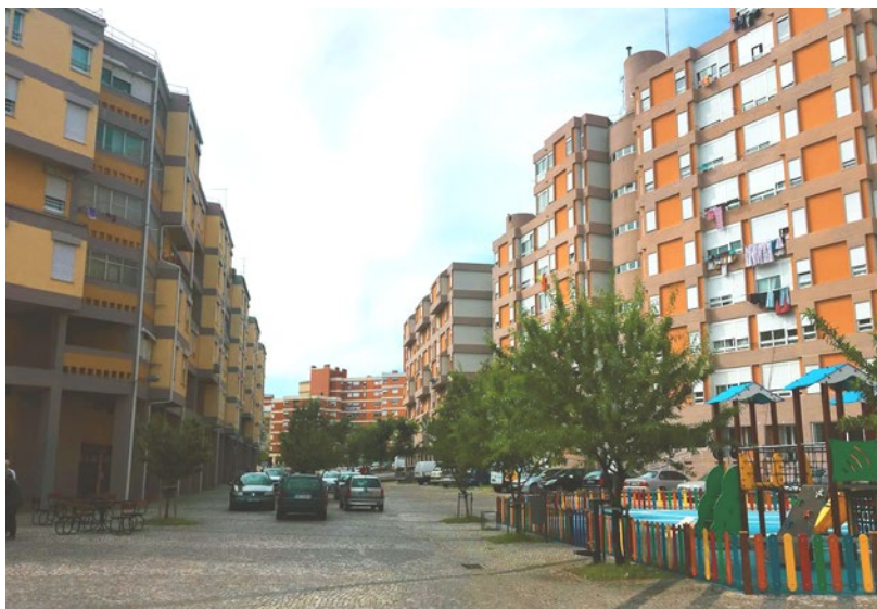
Fig.12 Zone I central strip