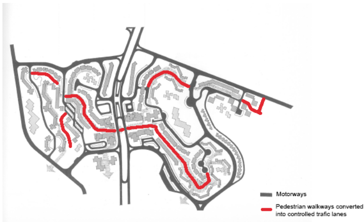
Fig.6 Zone I mobility system (adapted from GTH, 1972)