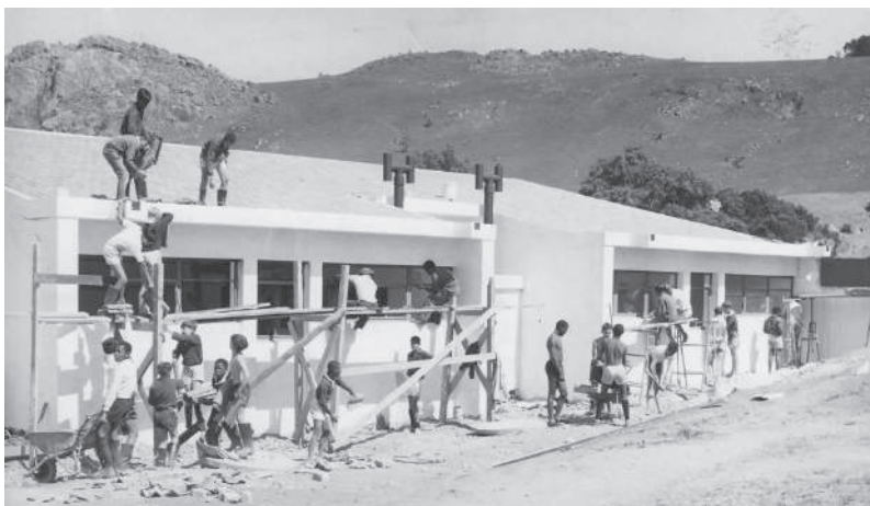
Fig. 3 Students and locals working in the construction yard of the school. (Unknown author, Pancho Guedes' archives)