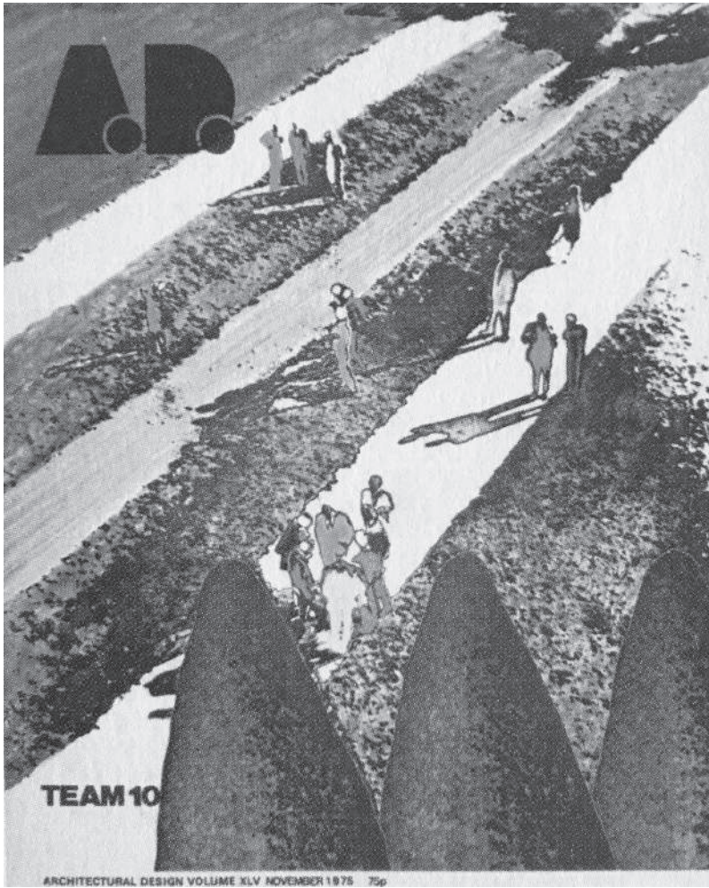
Fig. 2 AD Architectural Design Issue 1975:11. (Risselada, 2005)