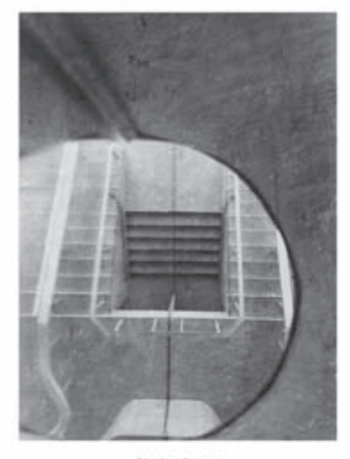
Stair Rooms Eseens Architectural Press