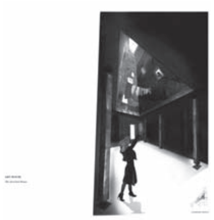
6. Student Project, Photomontage, Belfast & the Uncanny, Catherine Blainey.

One way of expressing this is to view architecture education as having elements of that of a craft. Like a craft there are formal exercises to be undertaken, core skills and competencies to be acquired and standards to be met. Above these however there is also a value system to be adopted, one that edits the world and allows someone to operate with clarity. For many student architects the first steps towards this are the adoption through imitation of anothers value system. The progression from imitation to nuanced independence informed by the broader culture of architecture is a core process.