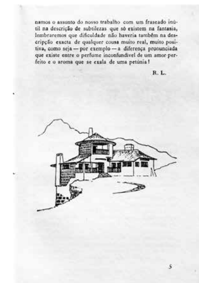
4. Casa de Chá da Boa Nova, Piscinas das Marés, Museu de Serralves, Faculdade de Arquitectura do Porto — Álvaro Siza