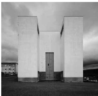
7. Igreja de Santa Maria de Marco de Canaveses — Álvaro Siza