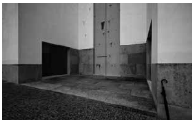
8. Igreja de Santa Maria de Marco de Canaveses — Álvaro Siza

Siza transforms door into space. Just like Alberti had made.