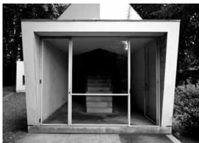
3. Pavilhão Carlos Ramos — Álvaro Siza

As Alberti states in De Re Aedificatoria : “Through the example of our ancestors, therefore, and through the advice of experts and constant practice on our part, thorough understanding may be gained on how to construct marvelous buildings, and from that understanding well-proven principles may be deduced; rules that should not be ignored by anyone eager – as we all should be – not to appear inept in what he builds.” (Alberti, 1988, p.159)