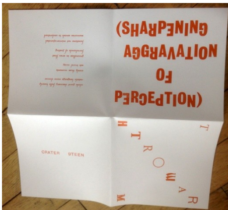
Figure 4. Tom Raworth, Sharpening Aggravation of Perception , Crater Press.

Michael Kindellan’s Crater 1 , which was actually something like the 6 th Crater to be printed, repeats a similar process—but it is a six-pager rather than a five-pager, and the sequence’s title ends up on the internal blank space. It is essentially an inside-out pamphlet; our expectation of reading title, author and publication information as an introduction to our consumption of the true poetic material of the sequence is frustrated. In fact, with pretty much all the Craters the reading experience should be preceded by just such a moment of introduction—a few seconds of confused non-literate reading before the poetic product is attained.