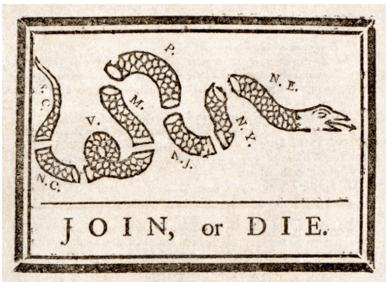
Figure 1. 'Join, or Die'.

While Franklin's career insists on a moving-away from Keimer's not-printing down more practical, profitable, Yankee avenues, some of his most famous printed interventions contain, nonetheless, the savour not-printing. Franklin's famous propaganda image, the 'Join, or Die' snake, is one such example (Figure 1). First published in the Pennsylvania Gazette on the 9 th of May 1754, here Franklin takes the American colonies (Delaware and Georgia are omitted and the four states of New England are shown as one, bringing the total down number of states from thirteen to eight) and divides them, after the image of the snake that, according to folklore, if reassembled before nightfall on the day of its death would back to life. Franklin's interrupted snake insists that we must urgently put these divided, disagreeing states (divided through the machinations of the British) back together before it's too late, to revivify as an identifiably 'American', post-colonial serpent. The image became an important identifier for the pre-revolutionary period, as the states began, for the first time, to feel a unity in contradistinction to their connection with Britain, and was then utilised throughout the War of Independence. We might see, then, a ghost of Keimer's obstructed printing in the divided snake of the Pennsylvania Gazette ; a dissociation that would colour the founding of the republic.