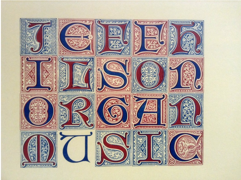
Figure 6. Jeff Hilson, Organ Music , Crater Press.

The title of Raworth's pamphlet, Sharpening Aggravation of Perception , is printed in alternating right-way- and wrong-way-up letters, again causing the reader to confusedly turn the pamphlet around in their hands as they seek to understand, to read, the title. Difficult titles are typical of Crater's production; Jeff Hilson's Organ Music (Figure 6) is one example of this, as is Ken Edwards's Millions of Colours . Both titles use a wayward lineation, and the constraints of speedy printing with limited resources and talent, to partially camouflage the identity of the poets, and to prolong and enliven the moment of first encounter with these texts.