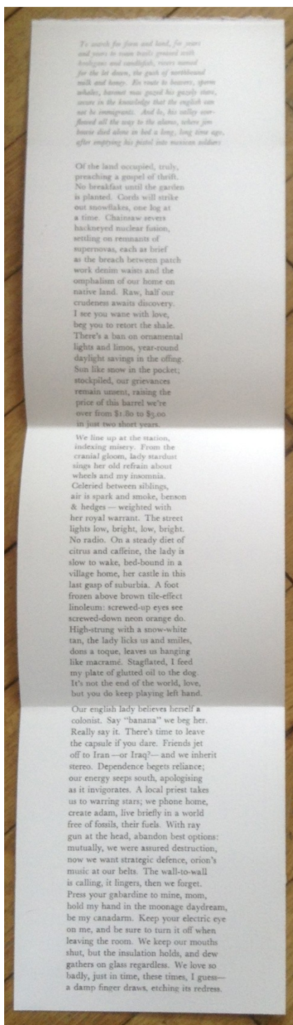
Figure 3. Sara Crangle, gimme your hands , Crater Press.