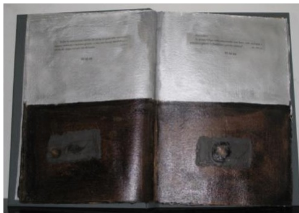
Figure 16. Leçons de Ténèbres: Ein Trauerspiel .