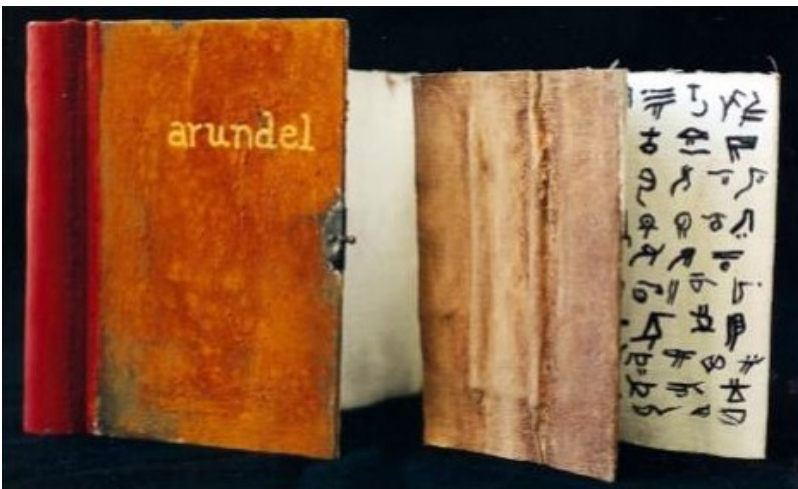
Figure 1. Arundel .

Book format is the cherished art form for José Oliveira expressing his art. His books are mainly codices, but he has also produced scrolls and leporellos. Oliveira uses each format with specific aims: to enhance the difficulty of reading, to puzzle the reader, to establish cultural connections. Oliveira uses the typographic and bibliographic conventions to disrupt reading as an active element in the emergence of perceived form. His books are artistic objects that combine self-reflection on their condition as books with self-reflection on their condition as artistic objects (Portela, 2013b: 96).