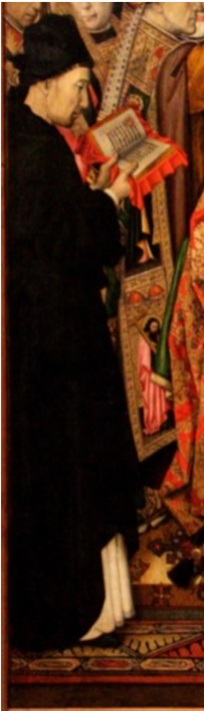
Figure 7. Jaume Huguet’s “The consecration of St Augustine”, detail.