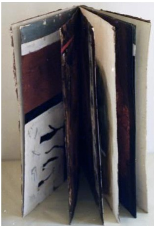
Figure 13. Mer-Mère 1933-1995 .