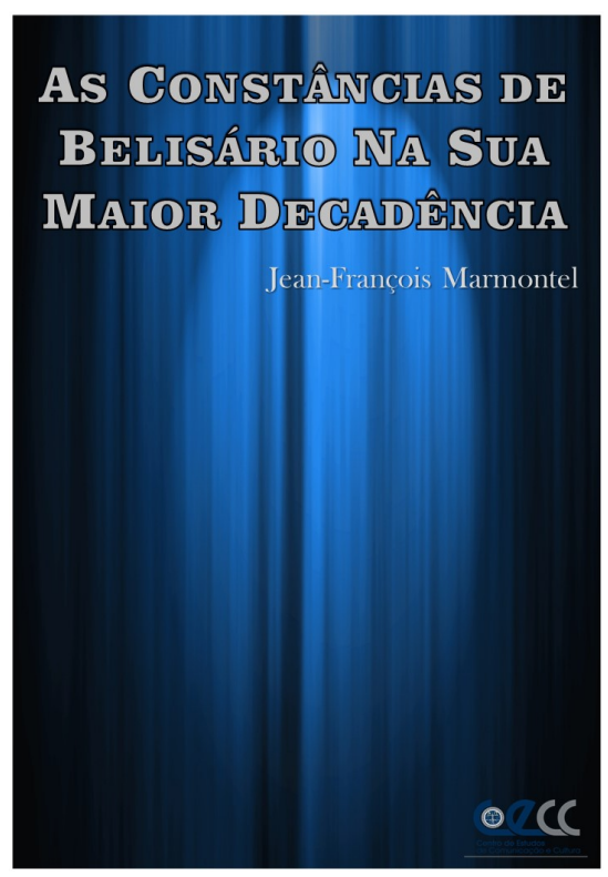
Figure 7. The cover of one of the edited plays (in collaboration with Gisela Canelhas): Bélisaire [As Constâncias de Belisário na sua Maior Decadência] (n.d.), by Jean-François Marmontel