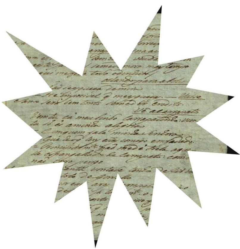
Figure 5. One of the manuscript forms of the video performance, recorded at the studio of the National Foundation for Scientific Computation, April 18, 2014.