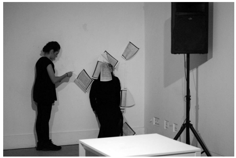
Figure 4. Author at Demimonde , Boavista Gallery, December 20, 2013.

wanted to experience the collection in a renewed fashion that did not entail reading, analyzing, studying, but rather expressed closeness and a sense of belonging. On the other hand, my goal was to defy manuscript conceptualization as a steady and solemn object of knowledge, an icon of the immutable past.