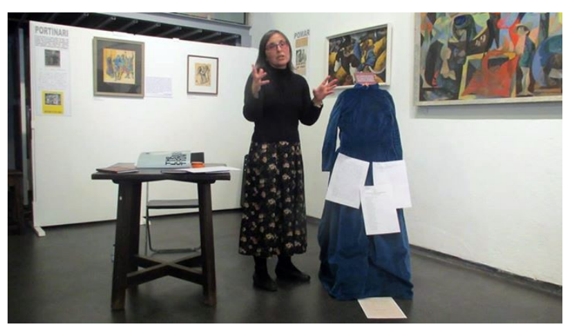
Figure 2. The New and True Story about the Queen of Volsco's Triumph: Assessing the Materiality of Editing. Casa da Achada, Lisbon, April 16, 2015.

After that, several pages of edited try-outs covered the skirt of the dress, as a way to attest the consistency of the materiality of the edition. The confrontation between the editor and the manuscript led to a new layer of materiality that not so much reproduced the manuscript integrity but rather transformed it. During this phase, the editor embraced both the scribe's apparatus and the alterity enabled by the correspondence between characters and speeches, assessing and refining criteria and methods for transcribing. Overall, it can be understood as an experimental phase that hopes to end with a coherent reading and a staging proposal as outcomes. In the present case, the final version of the edition i.e. that hopefully coherent reading and acting proposal gave rise to a book, but only after a series of required adjustments between different materialities, that of manuscripts in general, of each play in particular and of the draft versions of the edition itself. In my presentation, the book was topped at the end, placed as the head of the editing persona, making reference both to another layer of materiality, ensuing from the book format, and to a society that still relies on the book as major cultural product (Figure 2).