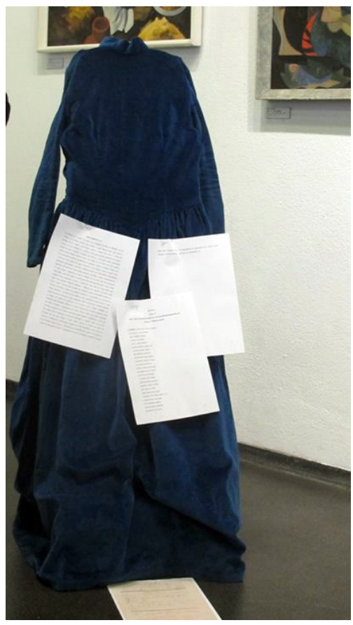
Figure 1. The New and True Story about the Queen of Volsco's Triumph: Assessing the Materiality of Editing. Casa da Achada, Lisbon, April 16, 2015.

On 16 April 2015, I promoted a session to present my book edition of The New and True Story about the Queen of Volsco's Triumph (1783/2015) and, at the same time, to discuss the topic of what I called the materiality of editing. My leading intention was to describe and explain the craft of editing to a non-specialized audience. I wanted non-specialists to be able to understand what editing means and the kind of gestures it comprises. In order to accomplish that, I staged the concept of "performative materiality", as I used specific materials, namely a ladder, a velvet dress, a reproduction of the front page of the primary source, pages of the draft of my edition and the final published book to unfold the process of editing, with its specific phases and outcomes. Each material / materiality played a specific role in the performance (Figure 1).