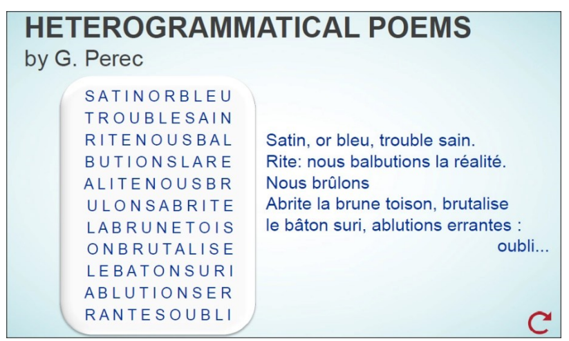
Figure 5. "Satin, or bleu ..." by Georges Perec.

The Four square model is very close to the simple numerical limitations (which are frequently used by Oulipo members): poetry texts with fixed number of verses, lines or words or even letters in the words. Oulipo members tried to complicate this task, requiring the use of equal number of letters in all words in the poem, or equal number of words in all verse lines, as it was demonstrated in the Rail by Georges Perec (Perec, 1976). Also the Four square model has its roots in Perec's heterogrammatical poems which are based on the tradition of word square, an acrostic which consists of a set of words written out in a square grid, such that the same words can be read both horizontally and vertically. In his heterogrammatical poems Perec used eleven letters and placed them in the square table where each line was made with the help of chosen letters permutation. Then all of these permutational combinations form the line of one hundred twenty one letters. Using spaces and punctuation marks it was possible to read the result as a small poem (Bonch-Osmolovskaya, 2005).