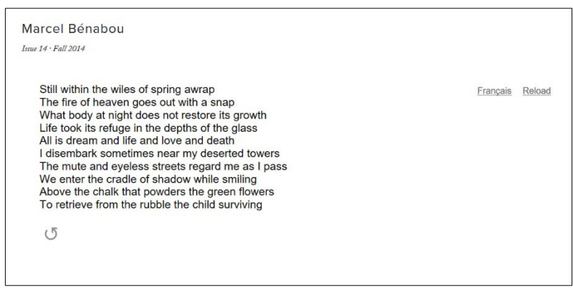
Figure 6. Dizains by Marcel Bénabou.

The Dizains by Marcel Bénabou partly explore one of the fixed form schemes: the ballade (Bénabou, 2016). As a verse form it was commonly popular in French poetry between the fourteenth and fifteenth centuries. The ballade typically consists of three eight or ten-line stanzas (dizains), each with a consistent meter and a particular rhyme scheme (ababbccdcd). But Bénabou modified the dizain form into twelve syllables of French alexandrine with a medial caesura which divides the line into two half-lines of six syllables each. The Dizains code algorithm permutates six pairs of rhyming lines in such a way that each pair can be separated by zero, one, or two other lines. The algorithm is capable of producing 145,920 dizain variations.