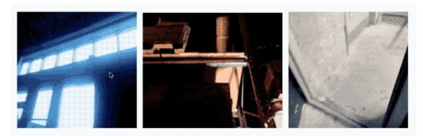
Figure 10. Voodle, 2017, by Sam Renseiw.

Amerika's feature film, Immobilité, made with a low-resolution mobile phone, is an improvisational fiction with two performers. Rather than strive to create an immersive narrative world, the work is a dérive in and out of an imagined foreign film, in which images and moving camera effects are unmoored from the subtitles and narrator's attempt to bring order. Amerika's palm-held camera work is erratic, intentionally amateurish and painterly. The camera's pixel grid has to catch up with the body's fluid gestures in its spontaneous encounters with the performers and the landscape, resulting in unexpected blurs and trails of color. Amerika equates this form of aimless cinematography with choreography and Gregory Ulmer's term choragraphy, which he (Amerika) defines as "the writing of intuition while inventing" (Amerika, 2009). In the Director's Notebook accompanying the film, Amerika cites Brian Massumi's description of this movement-vision as an "opening onto a space of transformation in which a de-objectified movement fuses with a de-subjectified observer. This larger processuality, this real movement, includes the perspective from which it is seen."