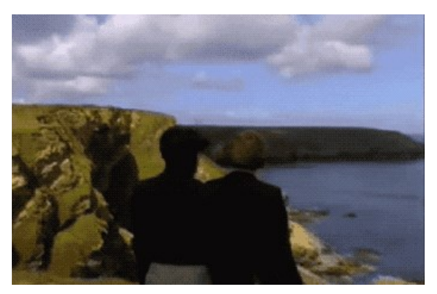
Figure 9. Immobilité, 2008, by Mark Amerika.

Amerika's feature film, Immobilité, made with a low-resolution mobile phone, is an improvisational fiction with two performers. Rather than strive to create an immersive narrative world, the work is a dérive in and out of an imagined foreign film, in which images and moving camera effects are unmoored from the subtitles and narrator's attempt to bring order. Amerika's palm-held camera work is erratic, intentionally amateurish and painterly. The camera's pixel grid has to catch up with the body's fluid gestures in its spontaneous encounters with the performers and the landscape, resulting in unexpected blurs and trails of color. Amerika equates this form of aimless cinematography with choreography and Gregory Ulmer's term choragraphy, which he (Amerika) defines as "the writing of intuition while inventing" (Amerika, 2009). In the Director's Notebook accompanying the film, Amerika cites Brian Massumi's description of this movement-vision as an "opening onto a space of transformation in which a de-objectified movement fuses with a de-subjectified observer. This larger processuality, this real movement, includes the perspective from which it is seen."