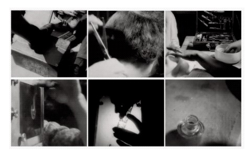
Figure 4. Man with a Movie Camera, 1929, by Dziga Vertov.

German Duarte, in his book Fractal Narrative , explores the evolution of cinema art as an increasingly complex geometry that, like the spatialization of hypertext and hypermedia, challenges classical narrative forms. For his theory of a fractal cinema space, Duarte draws on Deleuze's study of the geometrical rather than linguistic rules that govern narrative cinema. Deleuze looks to cinema as a tool to liberate human thought from hierarchical models and linguistic metaphors. For Deleuze, the essence of montage is "the act of putting the cinematographic image in relation with the Whole, that is, to link a single object with universal time" (qtd. in Duarte, 2014: 271).