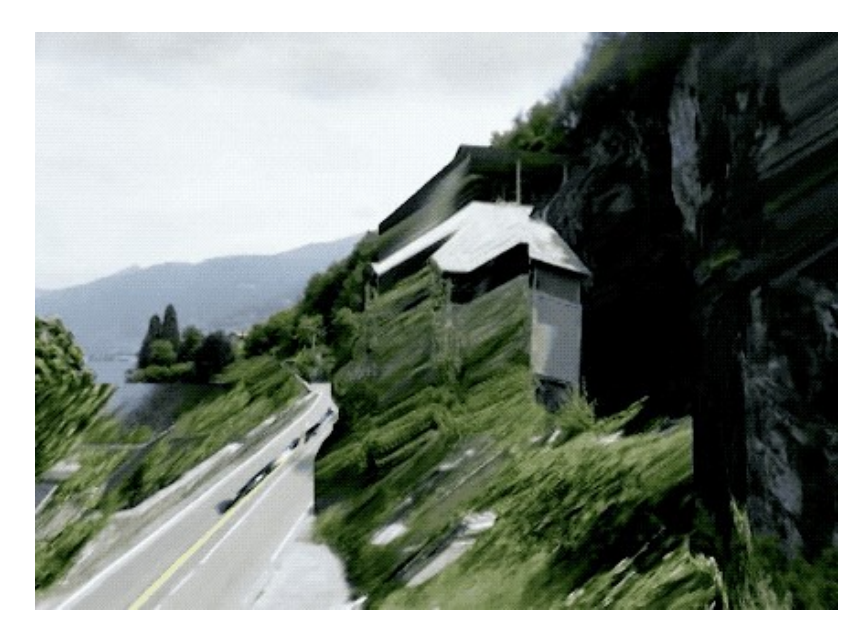
Figure 8. Lake Cuomo Remix, 2012, by Mark Amerika.