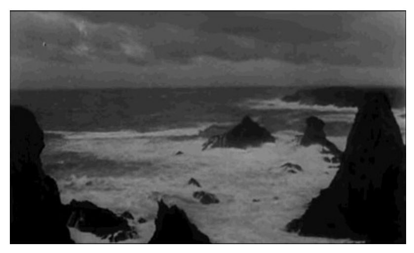
Figure 1. Le Tempestaire, 1947, by Jean Epstein.

construction of projective, imaginary and narrative space; 2) the design and manipulation of information space; and 3) the digital flaneur's exploration of embodied space. I consider these distinct yet interrelated spaces as zones where digital cinema-writing happens.