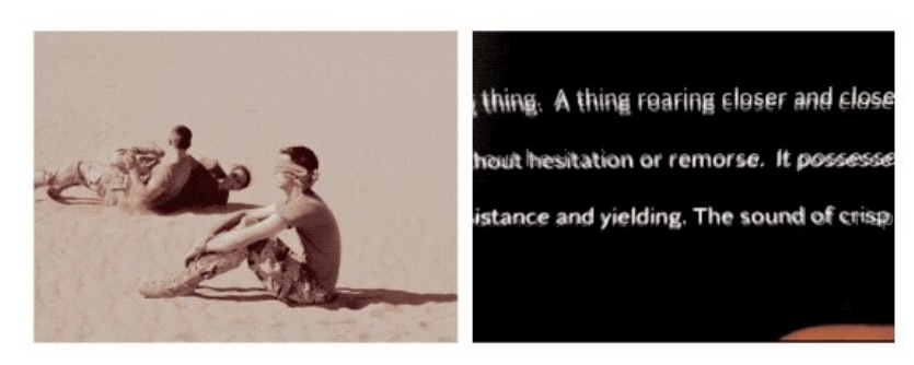
Figure 6. Pry, 2015, by Samantha Gorman and Danny Cannizzaro.

data. To capture video digitally is to translate changing light waves into information on a grid of vertical and horizontal units. Once stored, these discrete units, the pixels, are then available for nonlinear editing and for visual effects. On the other end, the surface of a digital interface is another pixel grid available for manipulation and capture. In movies, if a scene calls for a snowstorm, manipulations of the pixel grid can be employed to simulate an idealized snowstorm. Computation in this sense is used to efficiently control contingencies (the weather) and direct the intentions of "the writing" or preconceived idea by altering pixels. As Lev Manovich conceives it, cinema, by becoming code, has lost its distinct indexicality and is now a subset of digital painting and animation (Manovich, 2001: 307-308). But executing instructions on a mathematical grid is just as much a form of digital writing. An interface, like any computer-based image, is 1) made of discrete units, like language; 2) modular in that it contains multiple layers; 3) consists of a surface appearance and underlying code; and 4) contains hyperlinks to other media elements (Manovich, 2001: 289-291).