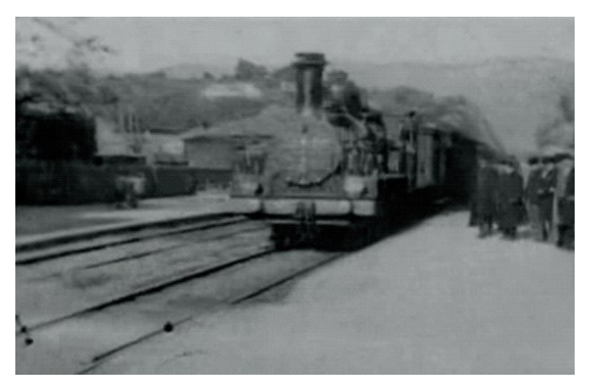
Figure 2. Arrival of a Train at La Ciotat, 1895, by The Lumière Brothers.