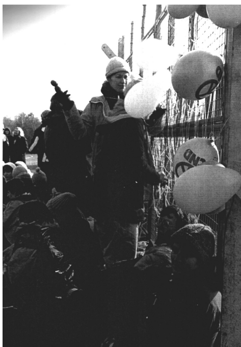
Torchlight anti-nuclear protest, Manchester city centre, 1984.