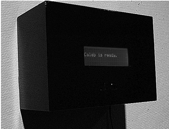
Figure 3. Caleb Larsen's Whose Life is it Anyway? (2008), screenshot. © Caleb Larsen. Reproduced with permission.

Now, the Katko and Valla piece is what we expect to find but, as culture shifts, Caleb Larsen's variety of language-driven work is likely to be even more widely propagated than Katko/Valla and it is, especially if we end up conceding that it is in some way literary, even more troubling for literature than cool representation. You might well say that it's cool, but it's not.