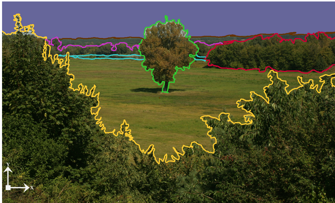
Fig. 2 - Landscape the neighbourhood Kaszczorek in Toruń in 2013.

Fig. 2 - Paisagem do bairro de Kaszczorek em Toruń em 2013.